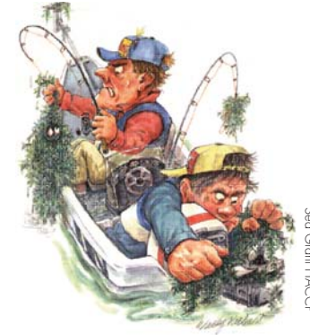
Sea Grant HAACP

Once they are here, the most common way aquatic invasive species are spread is by hitching a ride on a boat, trailer, boating equipment and fishing gear, including bait buckets. You can help keep all our lakes great by following the boater's checklist (at the back of this brochure) to make sure these harmful hitchhikers are not spread any further.