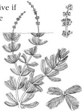
Eurasian watermilfoil, Myriophyllum spicatum